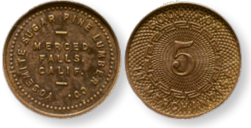
exhibit your own favorite lumber company tokens, wooden nickels, or one of your recent acquisitions. So that everyone may participate, please take pictures of your exhibits to facilitate viewing on Zoom.

December's meeting on Wednesday, December 27 will feature a presentation by Federico Castillo on the history of lumber companies in California as reflected by their tokens. Plan to